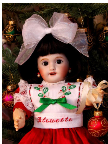
Cherie Limoge $350.00