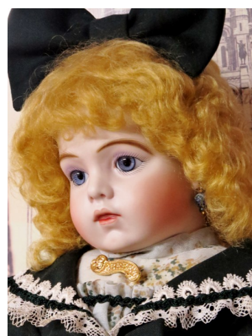
20" Bru 11 $595.00