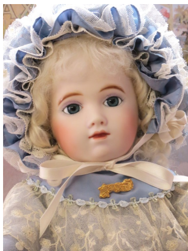
21" AT 11 $795.00